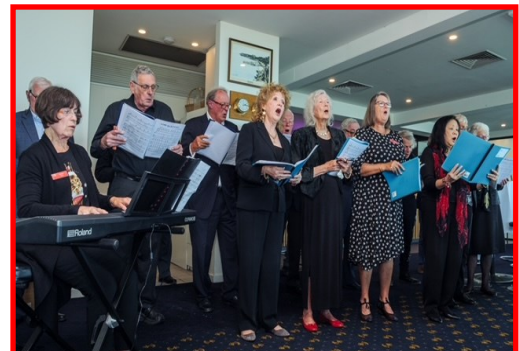
Bayside Notes Choir