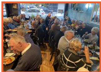
Tastes at Sazio's