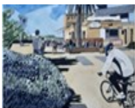
Some of Derek's paintings