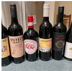
Selection of red wines from around the world