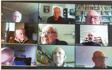
Some of the faces of those who took part in the discussion via Zoom

As the Covid news improves, we can soon expect to return to face to face contact