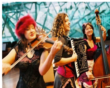
The Stiletto Sisters are a gypsy trio based in Melbourne playing songs of love, food and passion from Hungary, Russia, Eastern Europe including Klezmer, Yiddish songs, tango and French songs

Candlelight Dinner Sandy by the Bay - Wednesday July 28 6.30 pm