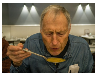
What our members are up to. Details: See p2