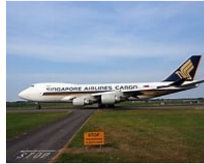
Ken said compared with other planes the 747 is benign