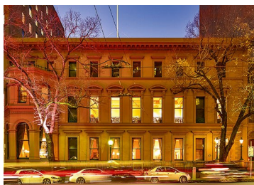
The Melbourne Club was established in 1838—three years after European settlement