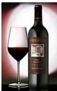
Family owned and run in Rutherglen, Warrabilla is best known for its blockbuster red wines