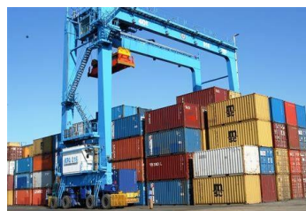
Melbourne's International Container Terminal