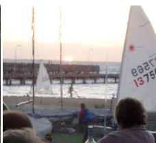
Royal Brighton Yacht Club