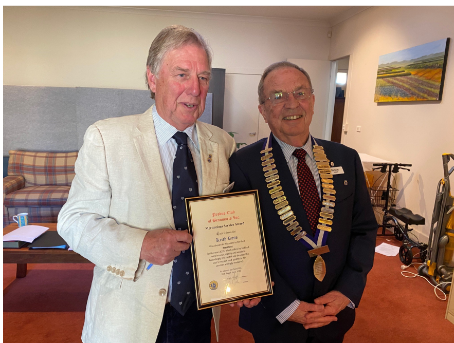
Snapshots of some of the shenanigans at the recent AGM