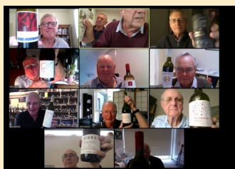
Left: Variation on a theme: our group of enthusiastic wine-tasters gather round Zoom to discuss their latest selections

In a 2-hour meeting via Zoom, 12 of our 14 members presented details of their chosen wine. In contrast to the sharing meeting we normally have, each member described details of their wine as they tasted it.