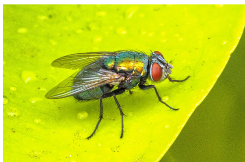
Below: Alan Steven's magnificent photo of a blowfly on a lemon tree