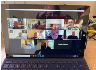
Above: Our regular discussion group in session via Zoom

The two groups are again combining to have a Zoom video discussion on Tuesday May 12. The topic is 'Australia after the Virus'. On April 17, 10 of us managed to see each other on our screens as we discussed the virus using Zoom. Despite a few teething problems it was a great success. There were many different opinions on the government's financial package and the restrictions that had been imposed but there was general acceptance that the 'national cabinet' was doing a great job dealing with the problems confronting the world.