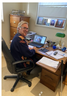
Left: The President giving the impression that he maintains his busy work schedule during the lockdown

For most, things are getting better and I am confident we can see the end of the tunnel and that life may get a little easier soon, but for our Club I expect it will take some months more for our life style to return to what will be the New Normal. In the meantime, we need to maintain our level of communication, using the technology we have at hand to continue to support each other. Remember: communication is a two-way street. Don't wait for a call, make one ! I also recommend that you visit the member profile page on our website as well as revisiting some of our past speaker videos. So, keep active my friends, both in mind and body. Stay safe, stay well.