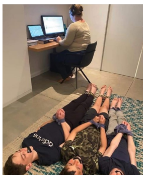
Left: A tip for successfully working from home

Please send your review of any books – or television shows – you think other members might find of interest. In the present circumstances, sharing such material will help us all to pass the time profitably. Ed.