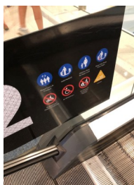
Right: Geoff Taffs