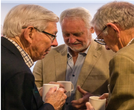
Above: Members at morning tea at the new venue, the Buckingham Motel