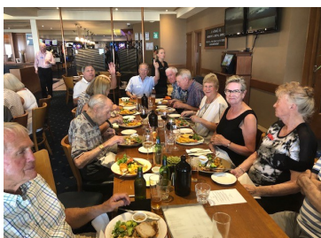
Above: Our happy group of Probians enjoying the January Pub Lunch