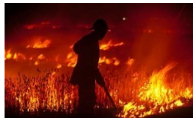
Blazeaid volunteers help lift the spirits of people who face devastating losses through bushfires, drought and floods.