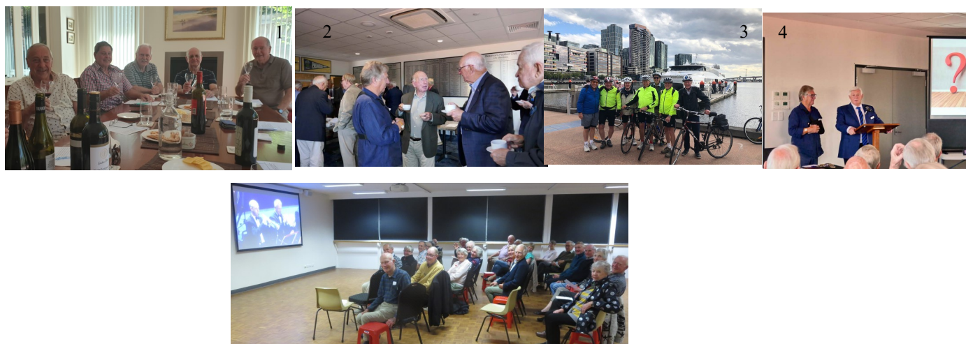
Above: The 19th anniversary of the Music Group - 26 members of the Group in their new venue at the Beaumaris Library.