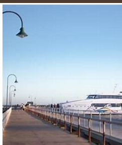
The Portarlington ferry