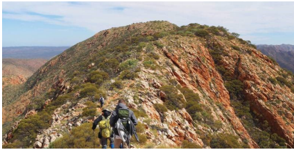
Intrepid bush walkers, including our own Ian Marchment, make their way to the top