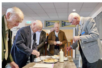
Below: A menagerie of members make a dive for the tea and biscuits at the July General Meeting