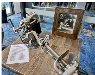
A Johnson Model 'A' made in 1926, revolutionary in its extensive use of aluminium which halved the weight and with exceptional engineering

Duncan Gibson opened his 10-minute talk with the historical backdrop of the European exploration of the USA and the use of its lakes and river systems. This meant a huge amount of people and goods moved by boat. While steam propelled some, the world changed forever in 1876 with Otto's internal combustion engine, followed soon after by outboard motors. The first designs were not pretty but Ole Evinrude made an elegant design with a marketing catch-cry of 'Don't Row'. In a world of paddles and oars, a new industry was born. The Evinrude brand still survives whereas hundreds of others haven't.