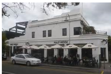
An iconic watering hole, set on busy Church Street

You are invited! 12 noon Wednesday July 24 at Half Moon Hotel in Church Street, Brighton, next to the railway line. Parking in car park behind Woolworths. CLICK HERE to register. Cost: $20 pp.