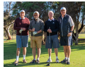
Ready to hit-off on Day 1