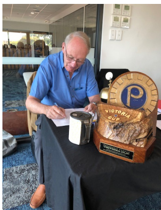
Below: Evidence of our hard-working Secretary

This January, our Club has had a very successful Pub Lunch in Prahran and also a visit to The Percy Grainger Museum. As I have said before in my column, our Probud Club has a variety of activities to get involved in which further the bonds of comradeship amongst our membership. I would encourage all members to participate in as many events and activities as possible (and including partners) so as to gain the maximum benefit and enrich our lives.