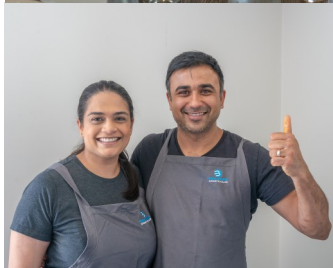
Above: Lunch at Beaumaris Sports Club

39 members and guests stayed for lunch after the January meeting to sample the excellent fare provided by the new caterers (left), Happy as Larry.