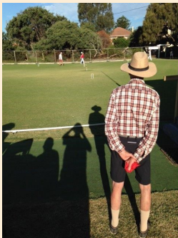
Above: There's even scope for the spectators to enjoy the day

To register, CLICK HERE and pay please by March 8.