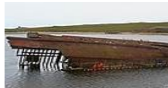
"the German Navy infamously scuttled its own fleet at Scapa Flow, in the Orkney Islands, northern Scotland"