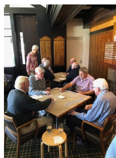
Bridge: Behind Closed Doors