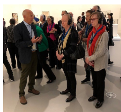
Members at the NGV