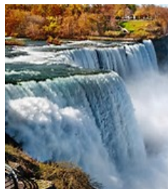
During peak daytime tourist hours, more than six million cubic feet (168,000 m 3 ) of water goes over the crest of the falls every minute.