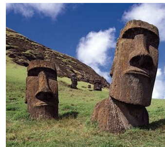
Above: Highlights included negotiating the Panama Canal and visiting the extant monumental statues, called moai, on Easter Island

Members wishing to access the Mississauga newsletter CONTACT, please click HERE