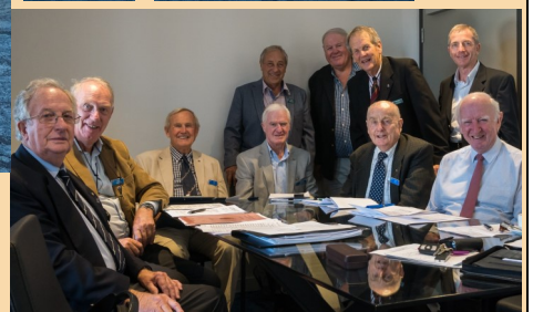
Above: Members assembled for the first Probud General Meeting in the new Beaumaris Sports Centre