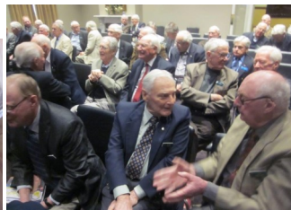
Left: A gaggle of Probus members prior to the start of the September meeting