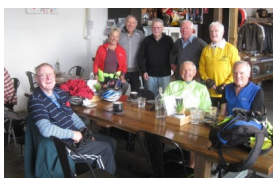
Left: A colourful array of Probus bike-riders assemble for morning coffee at a familiar haunt

The ride to 'Moto Cafe', Patterson, last month attracted eight members and a guest and was blessed with fine weather, although a breeze off the bay tested some of us on the return trip. What does not kill you makes you stronger! As usual, the hospitality at our destination was appreciated as a chance to gather strength. The ride for Friday October 27 starting from the Black Rock beachside car park is planned to follow the cycle path as far as the St Kilda Baths where we will refresh and take in the views. All welcome for an 8.30 am (summer time) launch.