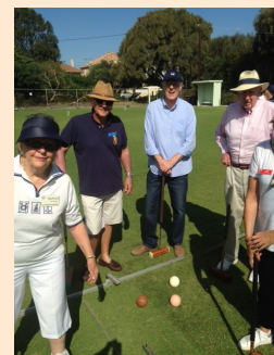
Left and above: Some of the highlights of the 2017 Probus Croquet Day and Spit Roast

For the Mississauga Club newsletter CONTACT Click HERE