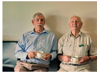
Members at morning tea at the November meeting