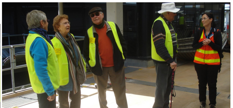
Eastern Treatment Plant Tour