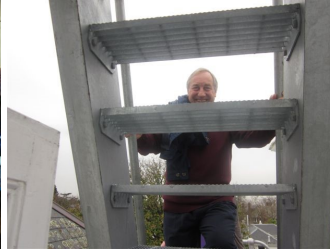
Toorak House in August