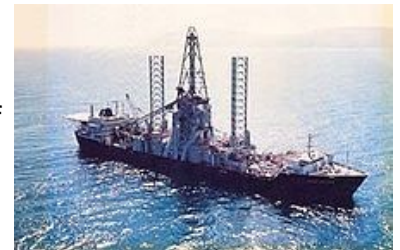
USNS Glomar Explorer (T-AG-193)

the Cold War, a Russian submarine armed with three nuclear-armed missiles and six torpedoes, explodes and sinks 750 miles north-west of Hawaii. After 15 months, the US Navy locates the sub at a depth of 16 700 ft, the equivalent of 17 Eureka Towers. The ship employed to lift the sub is called Glomar , 620 ft long (weighing 55 000 tons), 40 metres longer than the MCG arena. It has a hollow centre with retractable doors. Howard Hughes is appointed to manage the project which involves lifting a load of 8 000 tons. Our 10-minute speaker, Rod Kelly, fascinated all members at the August meeting with an amazing array of facts and figures about a little-known episode over 40 years ago that resulted in the recovery of nuclear-tipped torpedoes, key information on Russian submarine manufacture, operating manuals and the bodies of six sailors - at a cost of $800 million (in today's money: $4 billion).