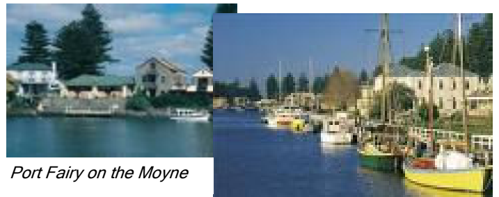
Port Fairy on the Moyne

We will tour Flagstaff Hill Maritime Museum and Tower Hill reserve and see the unique spectacular Shipwrecked Light & Laser Show. On Day 2, we travel by coach to Portland, ride the tram, tour the wharf and surrounds, visit Cape Bridgewater and a Portland strawberry farm. We spend some time at Port Fairy in the afternoon. This tour includes accommodation, all meals and entry to the Maritime Village, Shipwrecked Show and Portland tram ride.