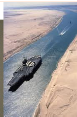
Above: Don Lobb and the Suez

Don Lobb sailed through the Suez Canal last year, a remarkable 190 km waterway. The canal was open for traffic in 1869 after 1.5 million labourers excavated 74 million cubic meters of sand. Designated 'the highway to India', it reduced sailing time between Northern Europe and India by about 10 days. Today's ships proceed both ways in convoys travelling for 14 hours to complete the journey (average charge: $295 000 per vessel). Several pilots and escorting tugs travel with every convoy to avoid costly delays caused by collisions or other accidents which could affect the 60 ships using the facility every day. Don's photos showed the ferries and bridges that cross the canal and the stark difference between green plantations and trees irrigated by the Nile on one canal bank and the sandy wasteland of the Sinai Desert on the other.