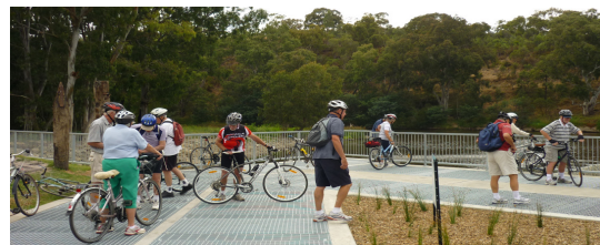
Not exactly flying, but this (above) shows intrepid Probus riders 'inspecting' the fish ladder recently installed at Dight's Falls on the Yarra, to help fish heading upstream. 14 riders participated.