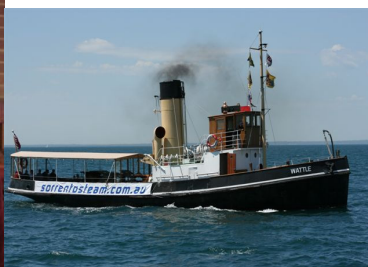
Below: ST Wattle on the bay