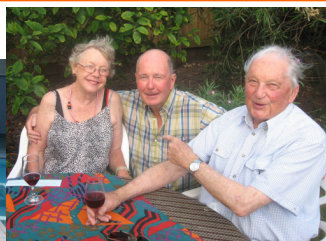
Annual Music Party, 2011

Our 10th annual party was blessed with good weather and forty-five people had dinner in the garden before the usual program of lighter music. The Lang Lang performance of Chopin's Grande Polonaise at the 2011 last night of the Proms ended the evening on a high note. Earlier, Ralph Butcher had an impromptu swim before going home to change and return in good health.