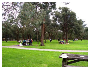
Jells Park, Wheelers Hill