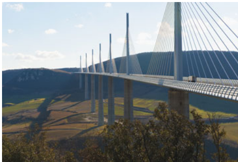
The famous Millau Viaduct over the Tarn Valley in Southern France