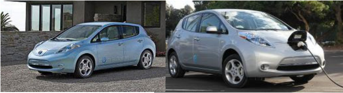
Above: The innovative Nissan LEAF shows its style