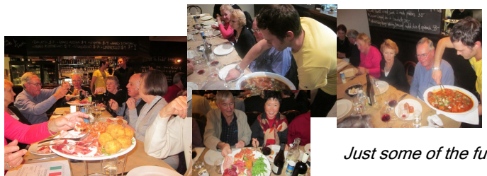
Just some of the fun