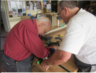
A hive of industry at the Beaumaris Men's Shed.