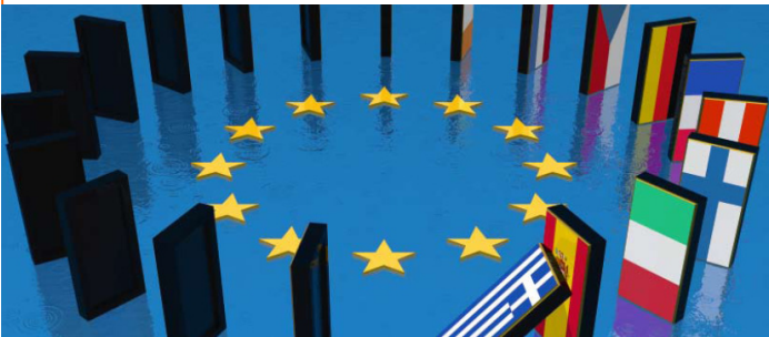
Above: The problem with Europe