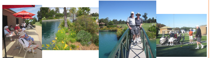
Probuss Golf Weekend, 2013, at Howlong Country Club

The 2014 Howlong golf trip is scheduled for the period Sunday October 26 to the Thursday morning (30/10) at the Howlong Country Golf Club. Golf will be played on the afternoon of Monday October 27, late morning/afternoon of Tuesday October 28, and the morning of Wednesday October 29. As usual, the annual putting competition will be held on the Wednesday afternoon prior to the presentation of trophies.