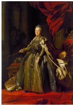
The most renowned and the longest-ruling female leader of Russia, reigning from 1762 until her death in 1796 at the age of 67. Her reign was called Russia's golden age.

"Showcases one of the world's greatest art collections. Featuring works by artists including Rembrandt, Rubens, Velázquez and Van Dyck, the exhibition offers over 500 outstanding works which includes the finest group of Dutch and Flemish art to come to Australia." See below.