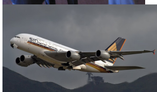
In the interest of balance, we should note that airlines other than Qantas operate with A380s