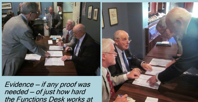
Evidence – if any proof was needed – of just how hard the Functions Desk works at our monthly meetings