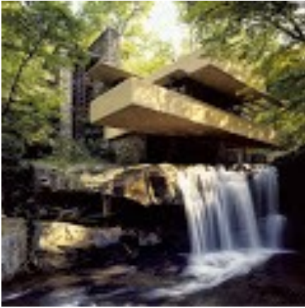
Left: Frank Lloyd Wright's home