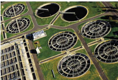
The plant sits on 1 100 hectares and treats about 330 million litres of raw sewage a day – about 40% of Melbourne's total sewage.

Part of the Melbourne Water facilities described by Shaun Cox, our Keynote Speaker at July's meeting, the Thompson's Road, Bangholme plant treats 40% of Melbourne's sewage. Unlike the Desalination Plant at Wonthaggi which we visited last winter, this plant is in full operation and is an integral part of our urban infrastructure. The 2-hour - mostly outdoor - tour provides a unique opportunity to learn about treating sewage including primary and secondary processes; capturing biogas to fire electricity generation; and the recently completed tertiary treatment plant producing high quality water for recycling to industrial users and golf courses. Travel independently by car and meet at 9.30 am at the Edithvale Seaford Wetlands Education Centre on Edithvale Road (Melways 93 E7) for a tour of this striking, energy sustainable building and bird-watching centre including morning tea/coffee. At 10.30 am we will transfer to a minibus for the short drive to the Eastern Treatment Plant for an 11 am tour