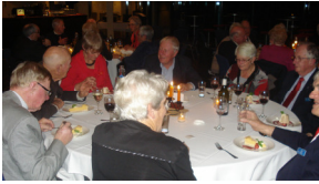
Continuing the great tradition of our Probus midwinter Candlelight Dinner