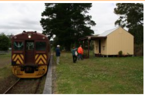
Our recent excursion to the historic South Gippsland Railway