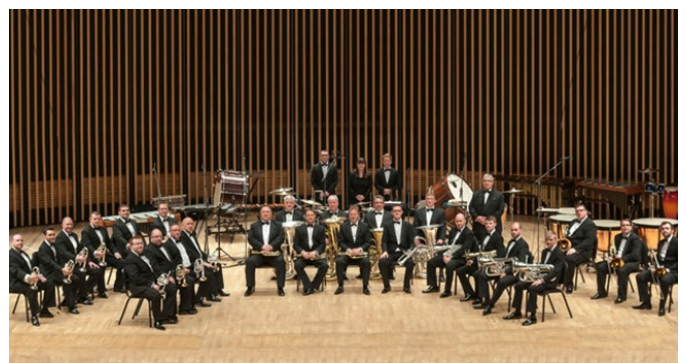
The Grimethorpe Colliery Band is one of the world's most famous brass bands, based in Grimethorpe, South Yorkshire, England. It was formed in 1917.