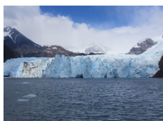
Left: El Calafate glacier in Argentina