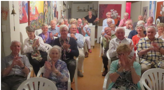
Fifteen years – and still going strong. Above, some of the enthusiastic revellers at Third Street Black Rock.