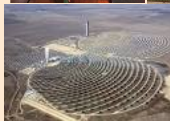
Left: one of the solar energy installations in Seville, Spain