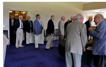
Right: Members at morning tea