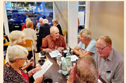
Happy faces at Taste's visit to Le Phan restaurant in Sandringham in April