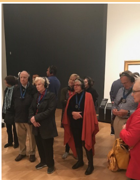
Beaumaris Probud goes to Van Gogh