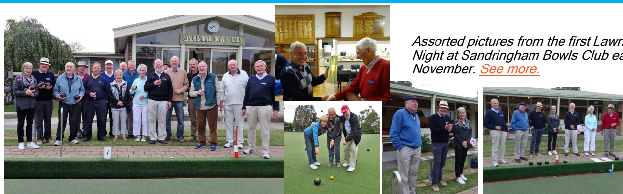
Assorted pictures from the first Lawn Bowls Night at Sandringham Bowls Club early in November. See more.

Probus Bank details: CBA BSB 063-144 Account No 10121288