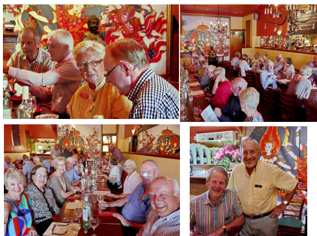
Above: Some of the many happy diners at the final Tastes for 2016 at Thai Rani

The universe - an interaction of time and space and its contents - includes planets, moons, stars, minor planets, galaxies, the contents of intergalactic space, and all matter and energy. The precise size of the entire universe, Philip told us, along with its evolution and composition is unknown but we should know that the observable universe is about 28 billion parsecs. For comparison purposes, the most distant probe from earth (Voyager 1 ) was 0.00065 parsecs from Earth as of August 2016 and it had taken 39 years to cover that distance. Today, astronomers have calculated a parsec to be a unit of distance equal to about 30 trillion kilometres. Phew! Philip also advised that there are 200 billion galaxies with an average of 500 billion stars in each. The figures are beyond rational comprehension but we should thank Philip for stretching our minds and beliefs in his short but provocative presentation.