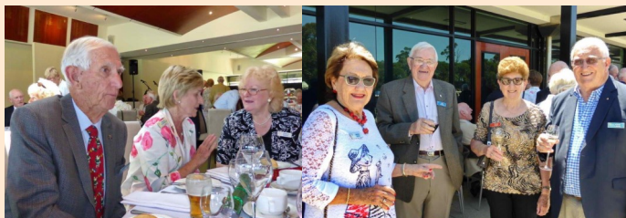
Above: Happy snaps from the 2015 Christmas lunch

This year, our lunch will be held at the Beaumaris Motor Yacht Squadron on beautiful Beaumaris Bay (Melways 86 F8).