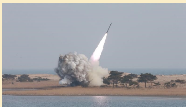
Above: A new multiple launch rocket system is test-fired in Pyongyang

10-Minute Talk: Ken Beadle - Bach by Bike