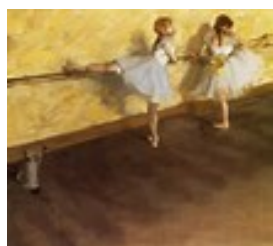
From the NGV's Degas Exhibition