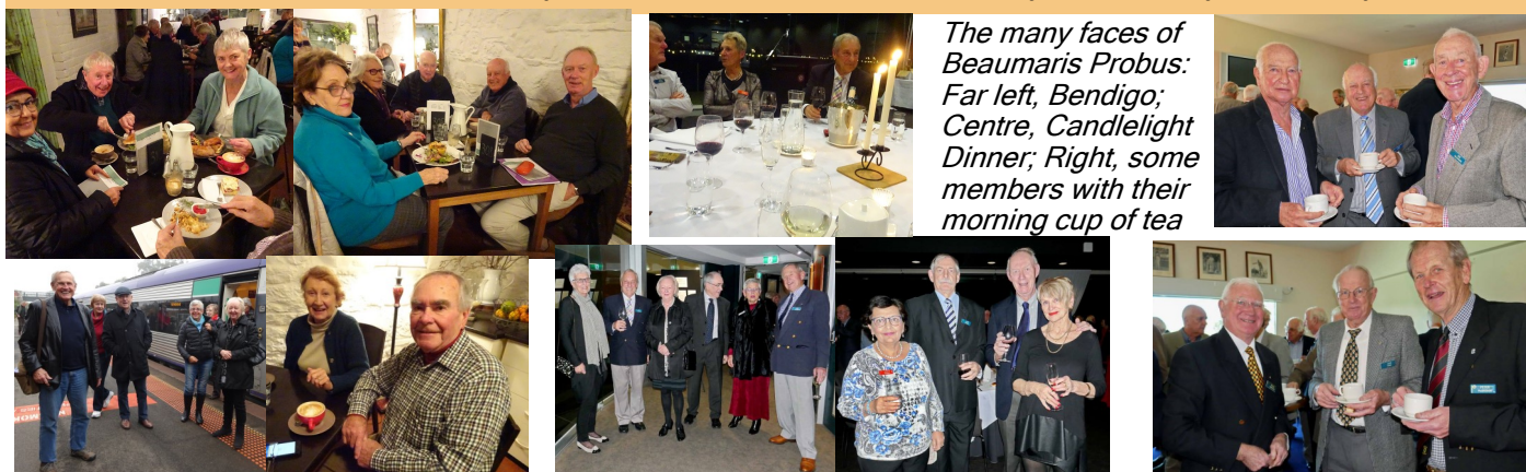
The many faces of Beaumaris Probus: Far left, Bendigo; Centre, Candlelight Dinner; Right, some members with their morning cup of tea